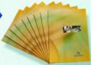
Brochures with saddle-stitching